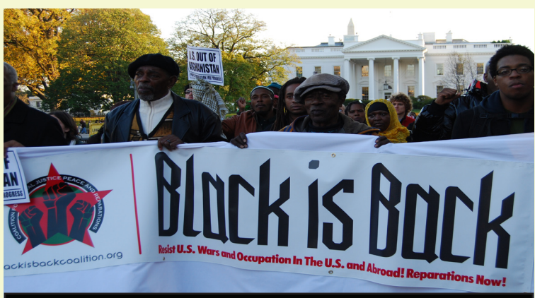
Uhuru Movement challenged Obama to address the conditions in the African community: "What About the Black Community, Obama?"